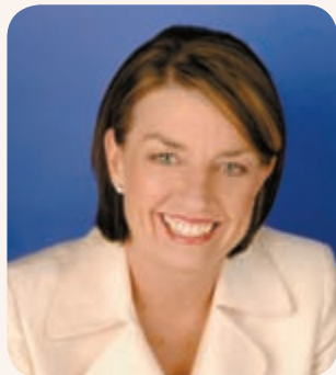
Anna Bligh MP Premier of Queensland