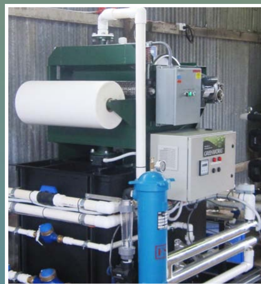
UV and cloth filter unit